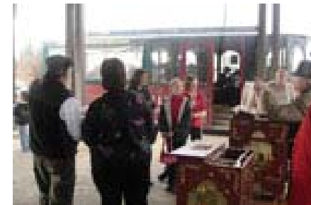
The trolley and organ grinder during the Christkindlmarkt.