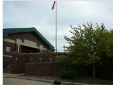
Ferdinand Elementary School