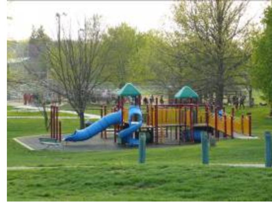
18 th Street Park Playground