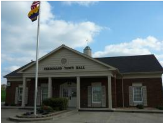
Ferdinand Town Hall