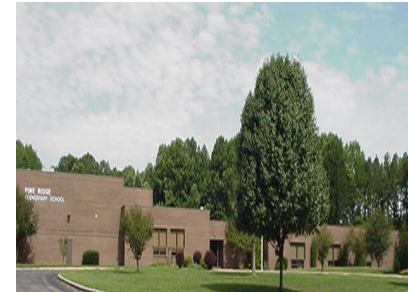
Pine Ridge Elementary School