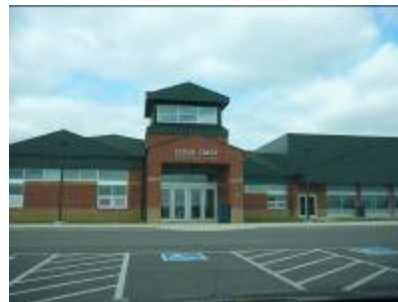
Cedar Crest Intermediate School