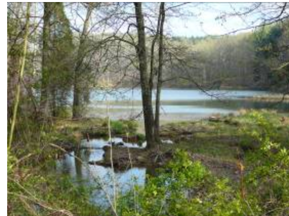
View from the Ferdinand State Forest