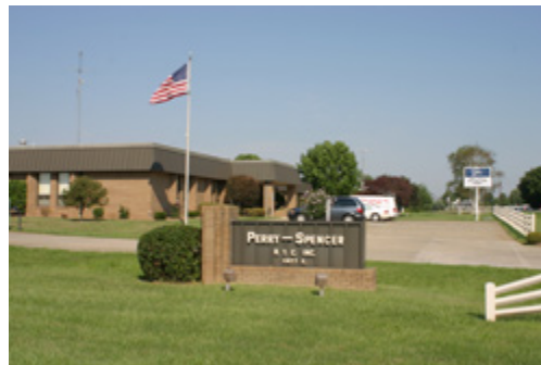
PSC office located in St. Meinrad, Indiana