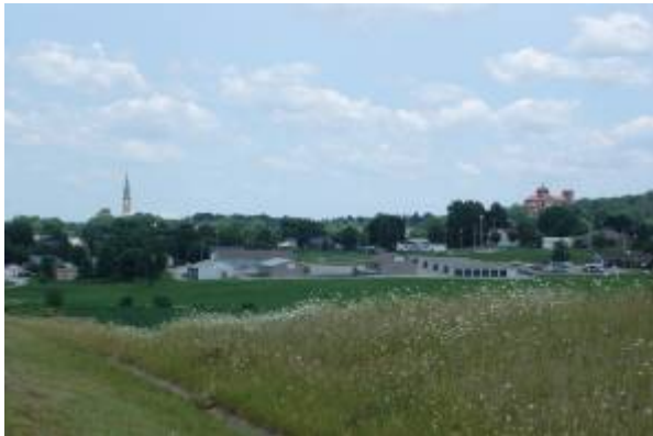
View of Ferdinand's horizon line