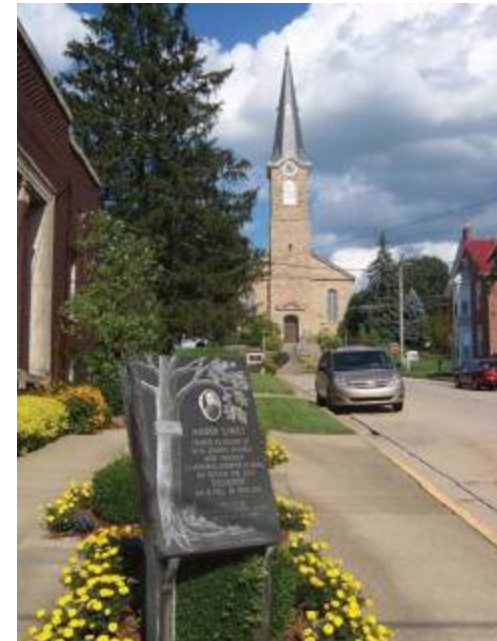
View of St. Ferdinand Church from Ninth Street