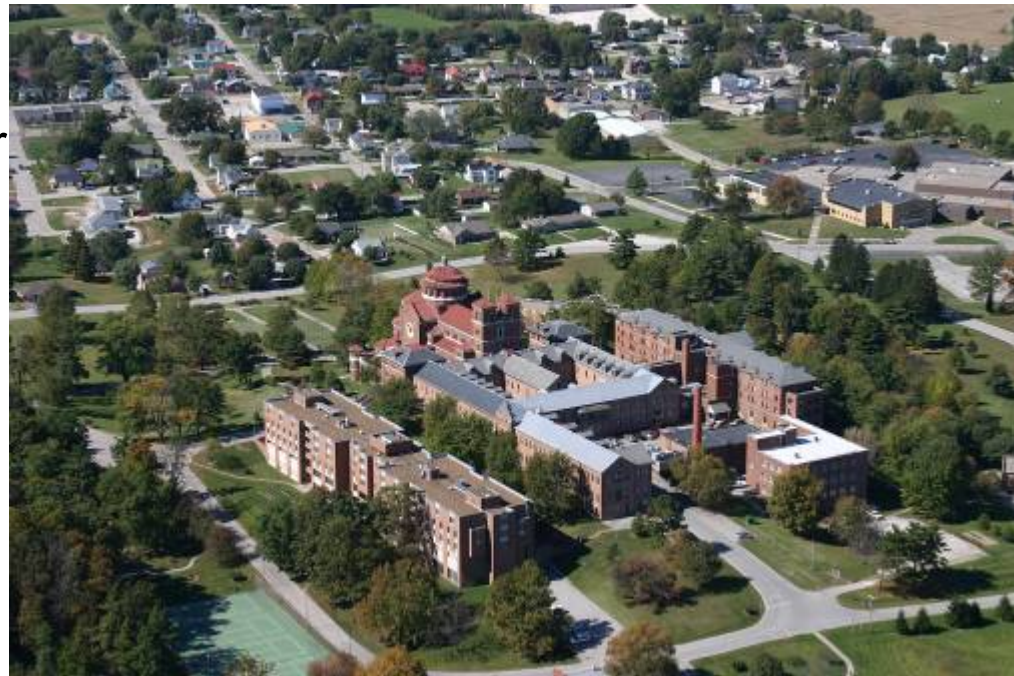
Arial view over the heart of downtown Ferdinand.