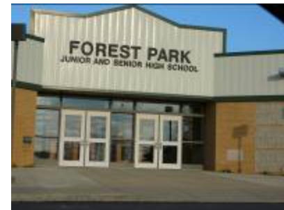
Forest Park Jr.-Sr. High School